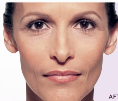
AFTER 1 YEAR

Actual patient. Results may vary. Unretouched photos of paid patient who received a 3-syringe treatment with JUVÉDERM® XC for parentheses and marionette lines. One syringe = 1.0 mL of JUVÉDERM® XC. These photos are not of a clinical trial subject.