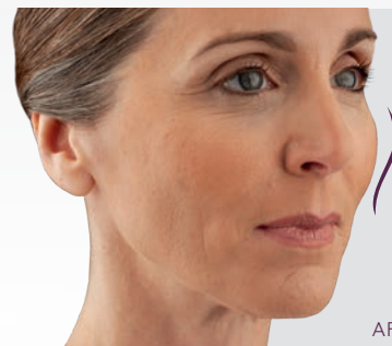
AFTER 1 MONTH