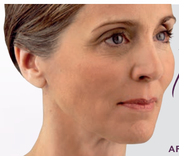
AFTER 2 YEARS

Actual patient. Results may vary. Unretouched photos taken before treatment, 1 month after treatment, and 2 years after treatment. A total of 3.5 mL of JUVÉDERM VOLUMA® XC was injected into the cheek area.